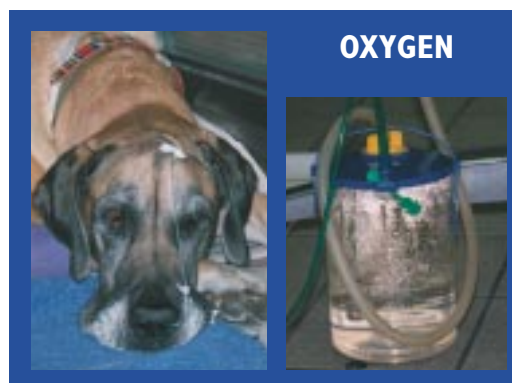
Fig. 1: Humidified intranasal oxygen administration and cage rest are an essential part of the treatment of a dog in acute congestive heart failure.

Oxygen supplementation should be established (preferably humidified as an intranasal catheter) (Fig. 1).