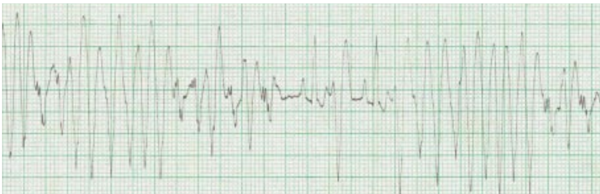
Fig. 3: An ECG (lead II rhythm strip) of a malignant ventricular arrhythmia that warranted immediate treatment.

The control of haemodynamically unfavourable arrhythmias and life threatening arrhythmias (Fig. 3) is important but one has to be aware that many arrhythmias will be controlled by controlling the heart failure. Sinus tachycardia does not warrant specific anti-arrhythmic treatment. With atrial fibrillation the aim is to control the ventricular response rate by controlling the congestive heart failure and by oral digitalisation (see above and later). If controlling the heart failure does not abolish supraventricular arrhythmias calcium channel blockers (verapamil 0.05 mg/kg slowly IV) can be used. Ventricular arrhythmias, when they occur as a consequence of DCM, should be treated if they compromise the animal haemodynamically or if they have a malignant aspect (couplets, triplets, R on T, polymorphic). Use lidocaine (intravenous bolus of 2 mg/kg can be repeated four times followed by a continuous rate infusion of 0.025–0.1 mg/kg/min) for rapid control. Beta-blockers (e.g. esmolol, 0.05–0.1 mg/kg slow; propranolol, 0.02–0.08 mg/kg IV slowly) can be tried in case of non-response but their negative inotrope effect should be considered in dogs with DCM.